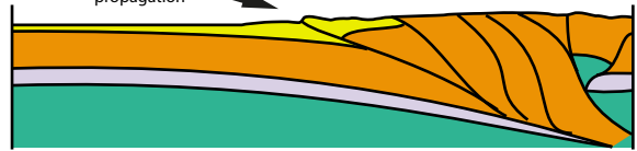
Longer thin- and thick-skinned thrust sheets