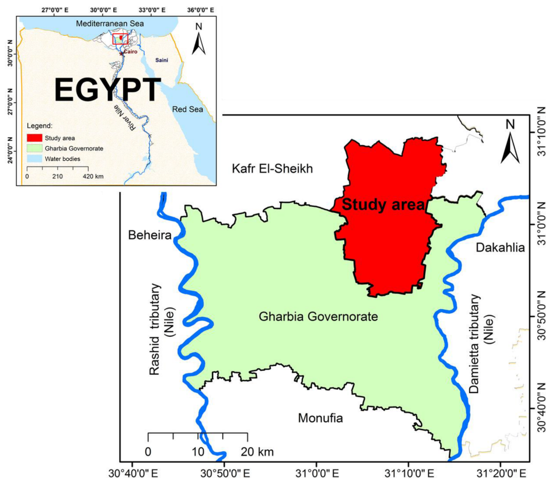
Figure 1. Location of study area.

similarly high in Cd do not seem to cause health problems for people living in Shiphams, England (Morgan, 2013). For the Cu-contaminated soils planted with tomato ( Solanum lycopersicum L.), these values would range between 32.9 and 1696.5 mg kg -1 , depending on soil properties (Sacristán et al., 2015). Accumulation of toxic heavy metals in living plant cells results in various deficiencies, reduction of cell activities, and inhibition of plant growth (Farooqi et al., 2009).