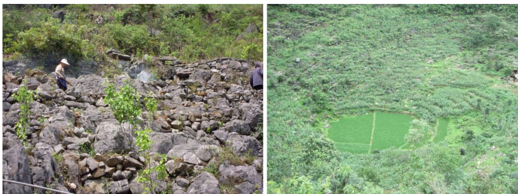
Figure 3. The peasants cultivated steep slopes in the karst areas in southwest China. Left: a peasant cultivating steep slopes in a karst area in southwest China, shot in Puding, Guizhou. Right: rice grows in the centre and corn on the surrounding slopes, shot in Pingtang, Guizhou.

desertification control on peasants' income are unclear due to a lack of quantitative research. Research results of similar ecological restoration projects, such as Sloping Land Conversion Program (SLCP), showed that the SLCP's direct impact on the income of participant households was insignificant. Instead, the increase of household income can be mainly attributed to the significant acceleration of the non-agricultural labour force (Li et al., 2011; Yin et al., 2014; Lin and Yao, 2014). Likewise, rocky desertification control has reduced the demand for agricultural labour and has promoted the transfer of agricultural surplus labour to non-agricultural employment (Xiao et al., 2012), which may have indirectly contributed to an increase of household income.