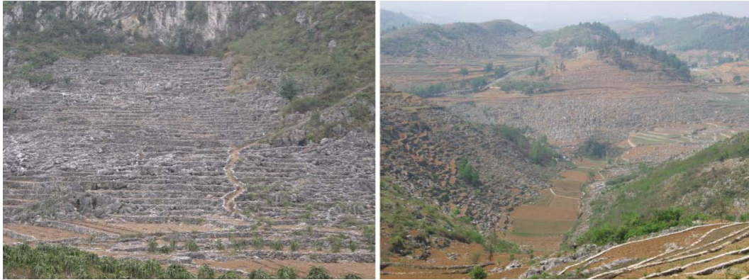
Figure 1. Karst rocky desertification in the karst area of southwest China (photograph location, left: Pingguo, Guangxi, right: Dafang, Guizhou).