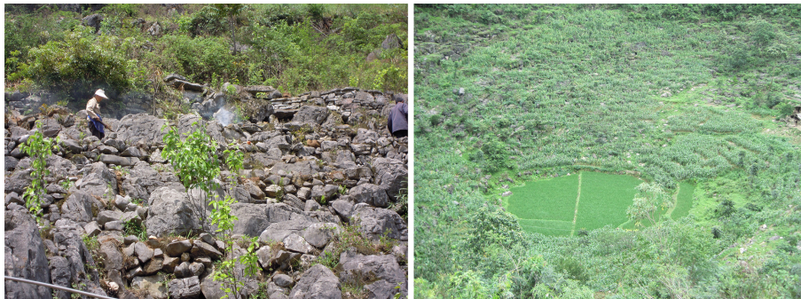
Figure 2. The peasant cultivated in steep slopes in the karst area of Southwest China. Left: a peasant cultivating on steep slopes in a karst area in Southwest China. Right: rice grows in the center and corn on the surrounding slopes.