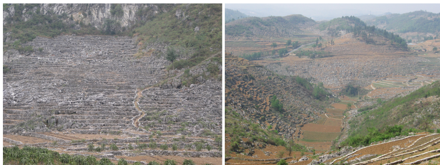
Figure 1. Karst rocky desertification in the karst area of Southwest China.