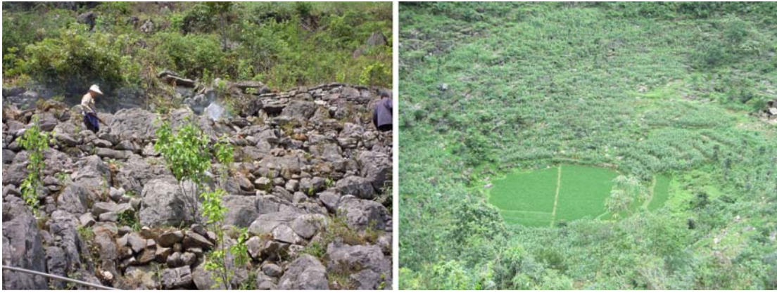
1 2 Figure 3. The peasant cultivated in steep slopes in the karst area of Southwest China. Left: A 3 peasant cultivating on steep slopes in a karst area in Southwest China, Site Puding 4 county,Guizhou Province. Right: Rice grows in the center and corn on the surrounding 5 slopes,Site Pingtang county,Guizhou Province.