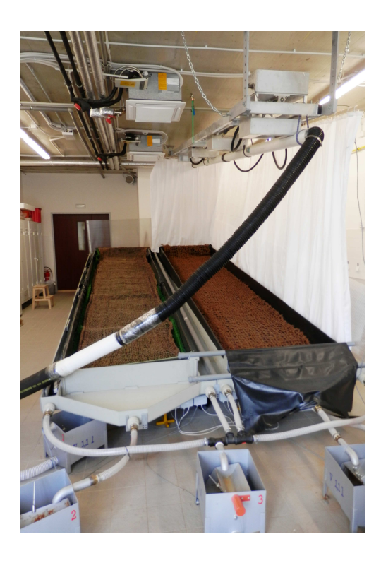
Fig. 1. Norton Ladder Rainfall Simulator above test beds with mechanical toggle flow metres. C400 coir erosion control net spread in the test bed.