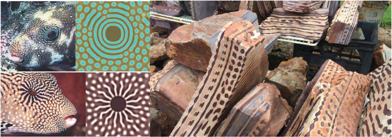
Figure 1. Dissipative patterns in chemical and biological systems: Simulated and real patterns on Puffer Fish (Sanderson et al., 2006) and strangely patterned siltstone (Zebra Rock, Ranford formation in the Kununurra district in the East Kimberley region of Western Australia). Both pattern formations can be modelled by a reaction-diffusion-advection type instability due to chemo-taxis.

here is that this applies generally to all THMC coupled processes. Excellent update of the formulation for chemical systems can 125 be found in Vanag and Epstein (2009). While chemical oscillations thus appear to be well understood, the phenomenon of an oscillatory response is less well established in other THMC systems. However, these systems show the same transitions from a simple continuum response to a highly localized state. The existence of a discrete, particle-like nature has also been discovered in fluids when they are driven far from equilibrium. If driven far from equilibrium by surface forces, fluids clearly show (see Fig. 2) a highly dissipative, sharp transition from a continuum state to one of a highly localized, propagating, particle-like state 130 (Lioubashevski et al., 1996).