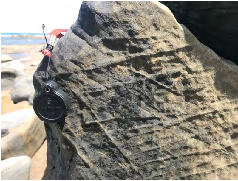
Figure 3. Dissipative patterns in solid systems: Two generations of compaction and shear enhanced compaction bands (hand lense for scale) in silt- and sandstones of the Miocene Whakataki formation, south of Castlepoint, North Island, New Zealand. The porosity reduction renders the bands less susceptible to erosion causing a marked positive relief. The periodic bands reminiscent of a standing wave phenomenon are thought to be the result of slow compression of the porous siltstone in the compressive environment (accretionary wedge) of the Hikurangi subduction zone.

diffusion formulation. In order to recover the dissipative wave equations, we present in the following the standard constitutive 160 assumptions for any generic thermodynamic fluid or solid mechanical system and describe how the physics of THMC feedbacks can be implemented to resolve the phenomenon of propagating dissipative waves in these systems.